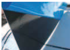
DOUBLE SIDED TAPE