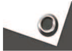
STAINLESS STEEL EYELETS